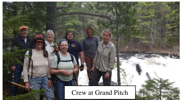
Crew at Grand Pitch